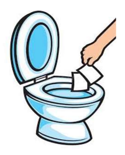
Step 8. Flush the toilet.